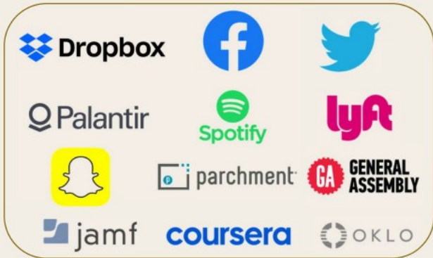
Select Exited Portfolio